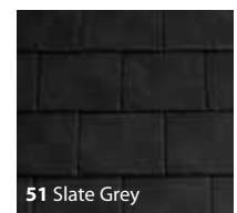
51 Slate Grey