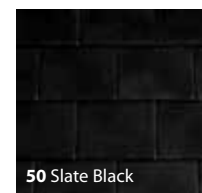
50 Slate Black