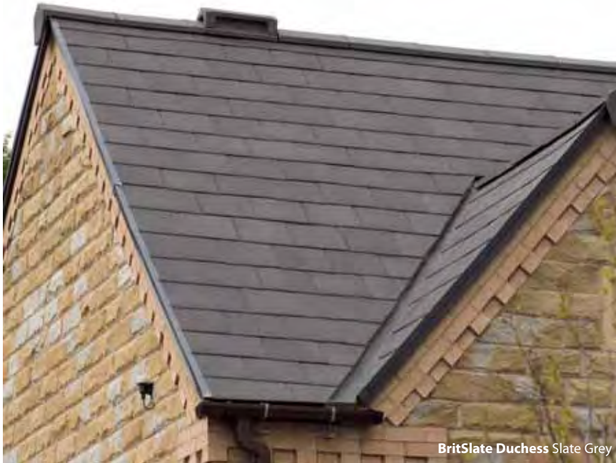
BritSlate Duchess Slate Grey