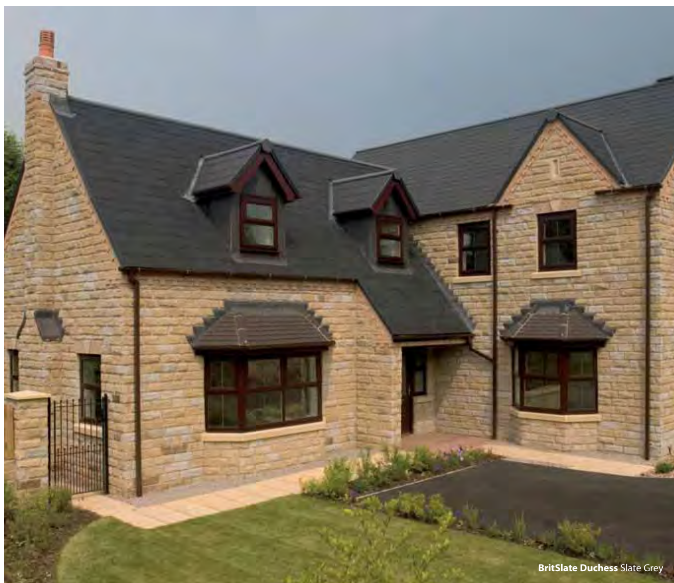
BritSlate Duchess Slate Grey